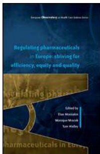
Regulating pharmaceuticals in Europe

To ensure equitable access to essential medicines of assured quality, safety, efficacy and cost-effectiveness for all Member States